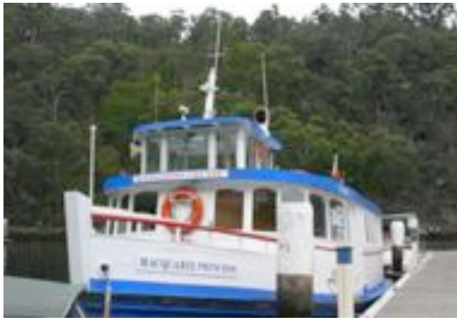
MV Macquarie Princess

This morning we travel by coach from Thirroul to Berowra where we board our chartered heritage ferry "Macquarie Princess" for a leisurely cruise on Berowra Waters and the Hawkesbury River. In the afternoon we continue to Cessnock in the heart of the Hunter Valley. We stay for 2 nights at Cessnock.