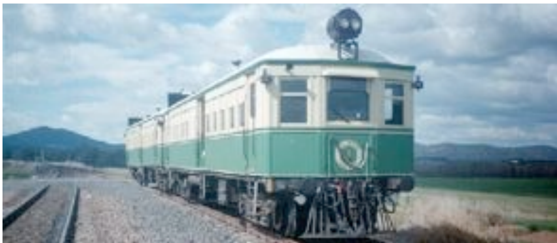
Railmotors on the Muswellbrook Gulgong line

Our all inclusive tour is fully escorted and is certain to give an insight into some hidden corners of New South Wales.