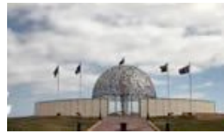
HMAS Sydney Memorial. Situated on Mount Scott, and overlooking Geraldton, this unusual and impressive memorial commemorates the deaths of the crew of the HMAS Sydney in 1941