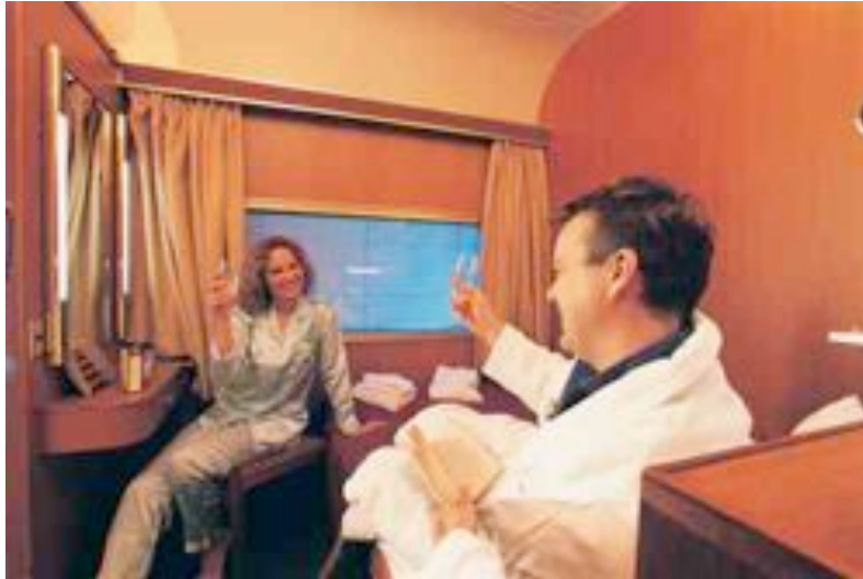
Chairman's Carriage double bed cabin

The Chairman's Carriage accommodates a maximum of 8 guests in 4 cabins, it has 2 spacious deluxe cabins featuring double beds and a two way full size bathroom. There are 2 twin cabins which each feature a three seat lounge converting to an upper and lower berth with ensuite bathroom facilities.