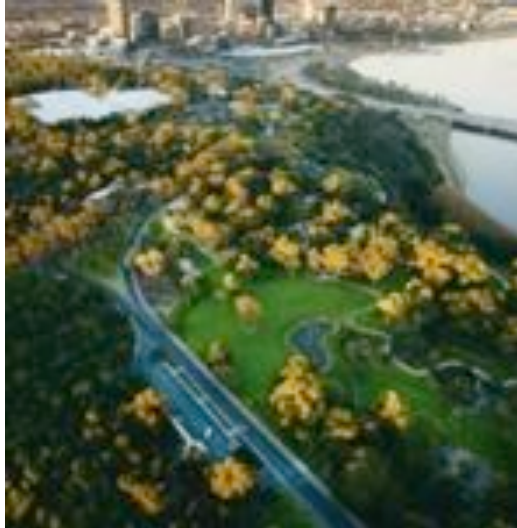
Kings Park and city of Perth