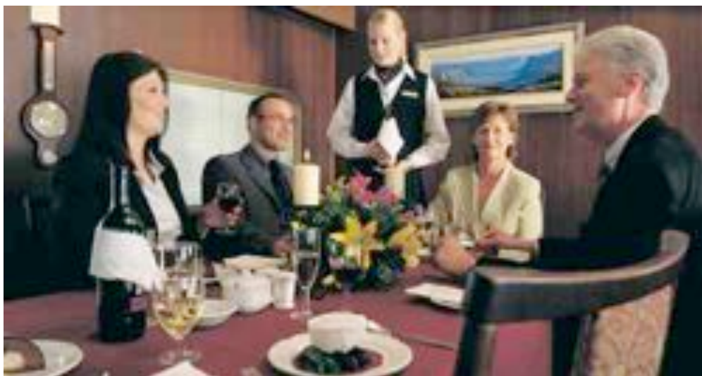
Chairman's Carriage Dining

The carriage will be at one end of the train to ensure the privacy of our guests on this tour. We can offer the exclusivity of your own bedroom, dining area, lounge and bar area and our own chef to prepare all meals which will be served in the dining room of the Chairman's Carriage.