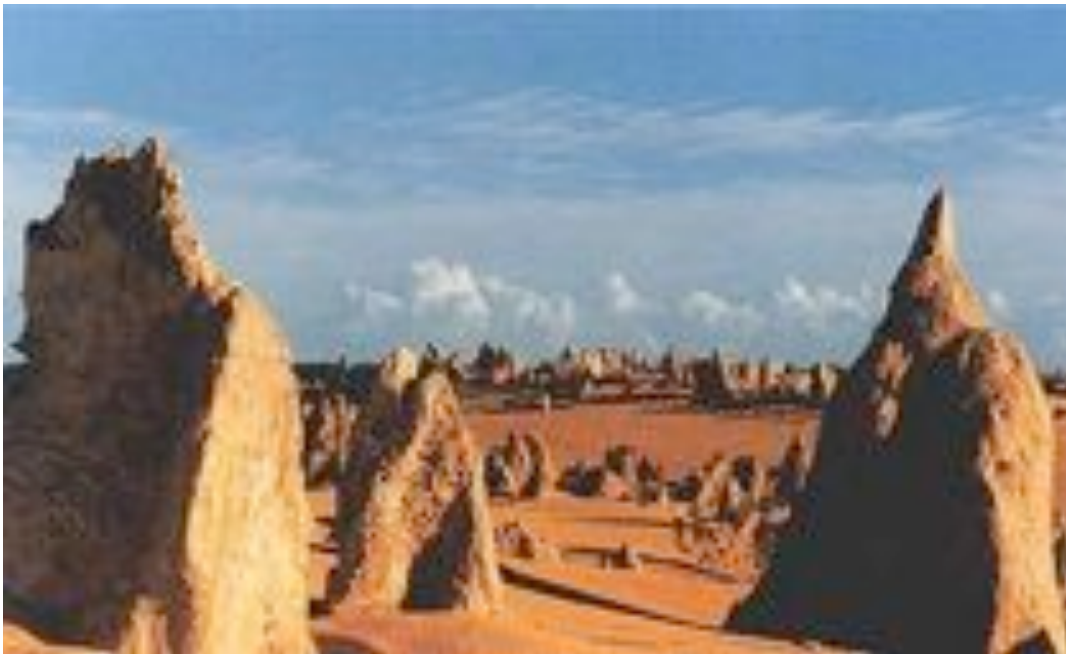
The Pinnacles in Nambung National Park