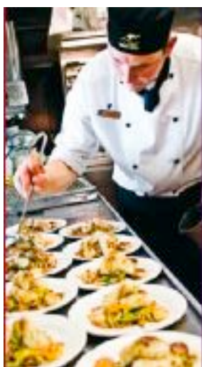
Chairman's Carriage Chef

Our chef will prepare all meals in the kitchen of the Chairman's carriage. We invite you to dress for dinner with Black Tie for gentlemen and After Five for ladies. Table d'hote dinner menus will consist of two choices for all three courses. Wines can be purchased on board or you may bring your preferred vintage with you.