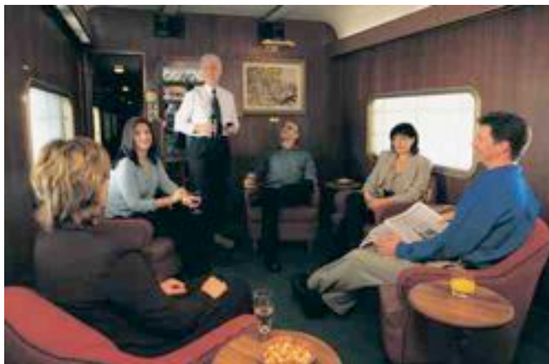
Chairman's Carriage Lounge